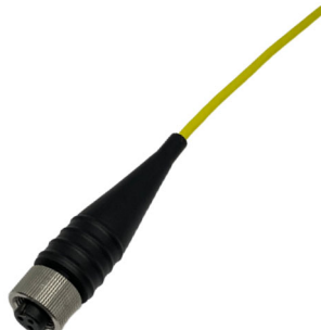
CMCP603H 3 Socket Locking Collar