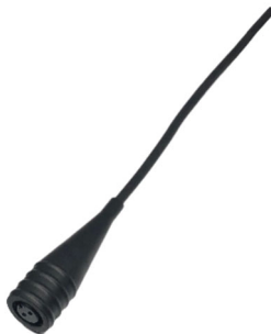
CMCP602HST Push On IP68 Connector