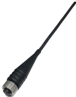
CMCP603L 3 Socket Locking Collar